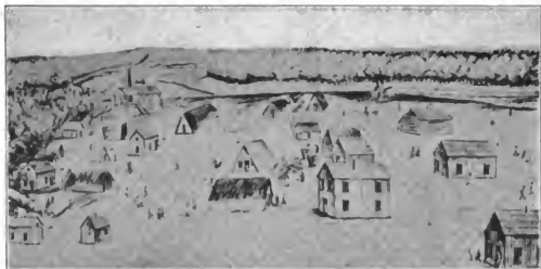
PEN SKETCH OF LAWRENCE, 1854-5.